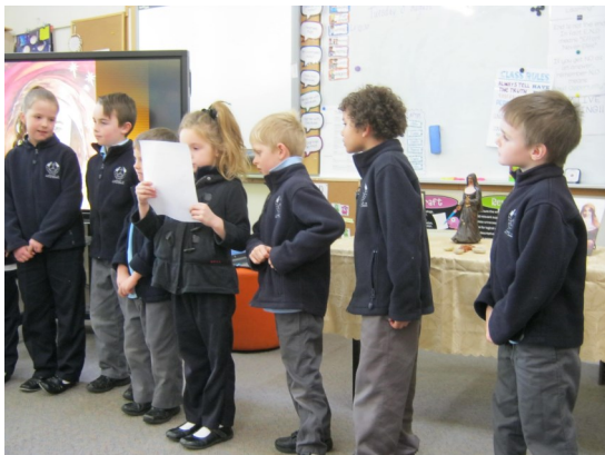
St Mary MacKillop prayer service