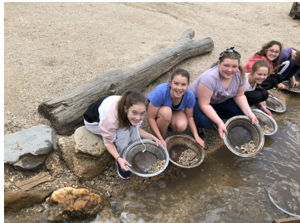
Grade 5/6 Camp to Ballarat