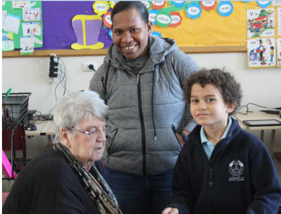
Grandparents & Special Friends Day