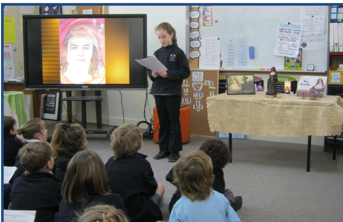
Feast of St Mary MacKillop