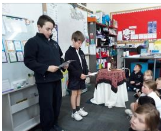
St Mary MacKillop Liturgy