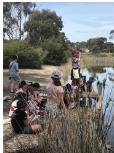
Grade 3-6 Camp to Nhill