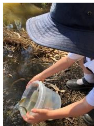
Willow Lake fish release