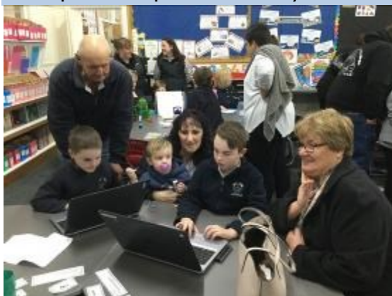
Grandparents & Special Friends Day